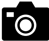
Photo retakes will be 9 November. For parents/guardians who would like a photo retake, please send a note with the students in their agendas. This helps teachers identify who needs their photos taken and will allow the process to run more efficiently.