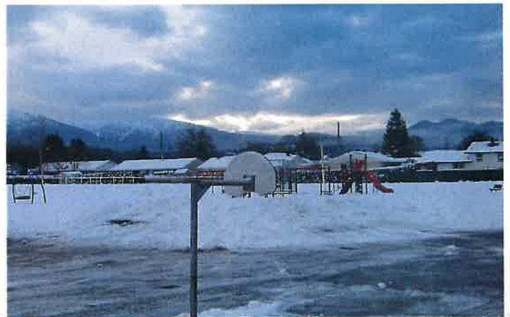
Winter Weather - Snowpant Season

Please ensure your little ones are bundled up appropriately !!