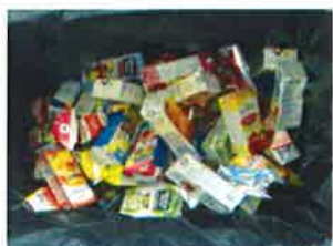
Collecting Empties in the Lunchroom