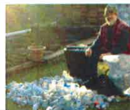
Finishing the Job.