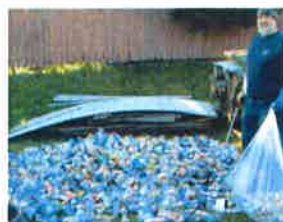
Sorting the Pile in the Backyard.