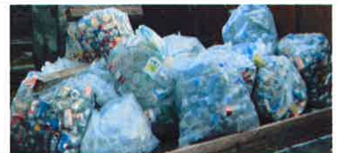
Ready to Haul to the Depot.