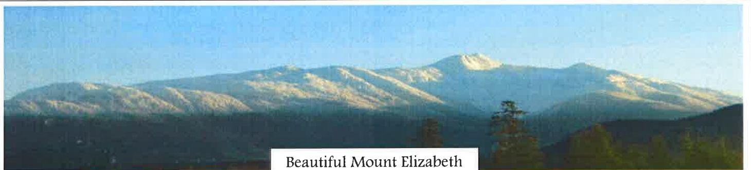
Beautiful Mount Elizabeth

Students and staff alike were delighted with teachers who adorned themselves as characters from the "Mr. Men and Little Miss Series" by Roger Hargreaves.